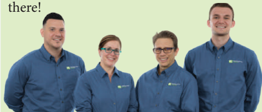
This monthly publication provided courtesy of Meeting Tree Computer.

We are looking forward to seeing you there!